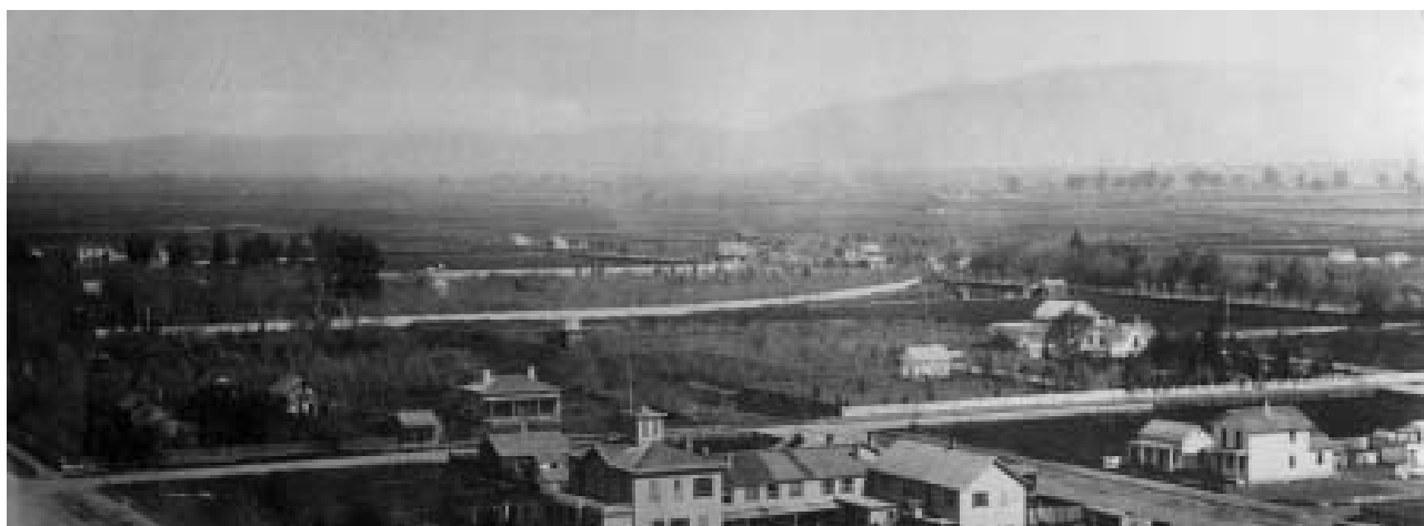
1868 view of the district from the south. Julian Street is in the foreground.