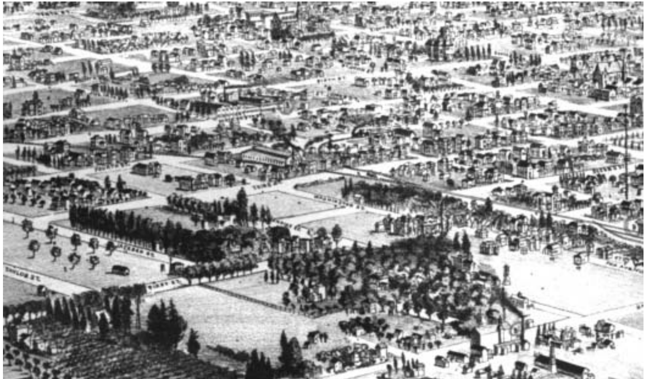
1885 Bird's Eye View of the Hensley estate and environs, viewed from the northwest. The row of trees on the left is Jackson Street, and the large cluster of vegetation in the center is the Belden Estate at First and Hobson Streets.