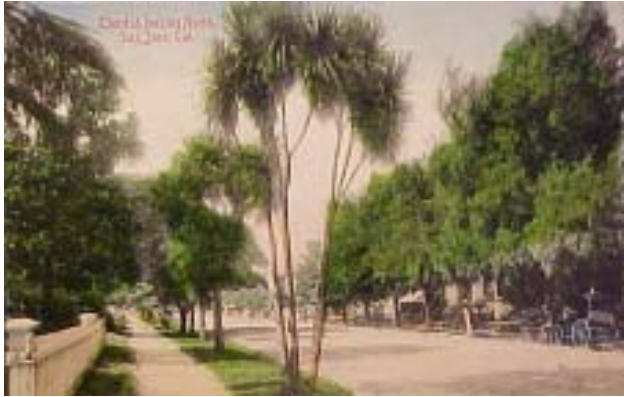
Circa 1900 postcard view of North Third Street