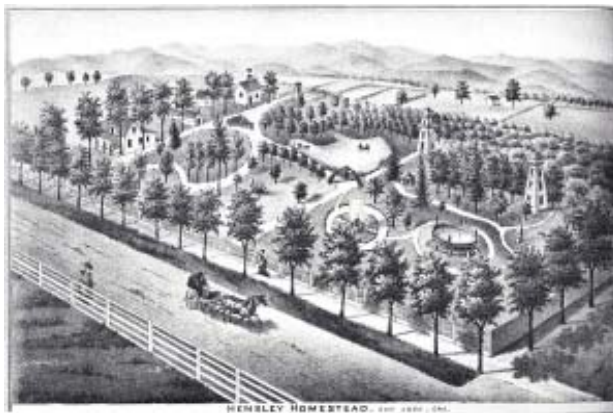
1876 Thompson & West Atlas, showing the Hensley estate, viewed from First Street